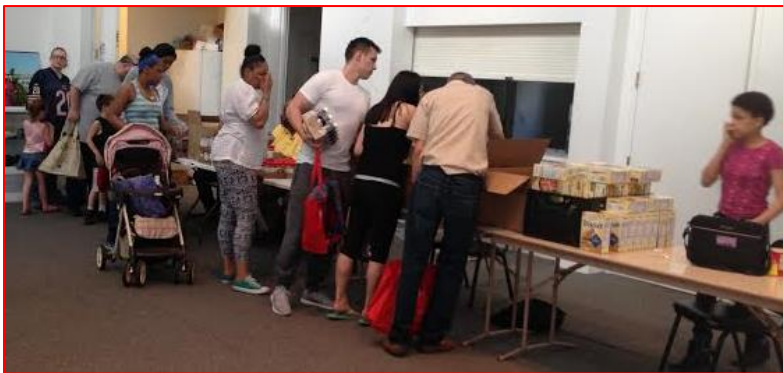
There are food pantries open Monday through Friday