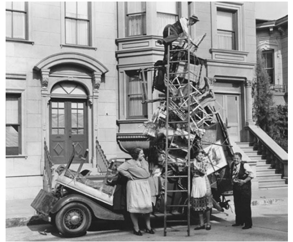
Not a real Love INC picture :)

.....these are just some of the areas YOU made a difference!