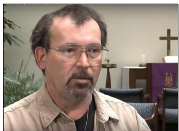
He shared his testimony in a video

First United Methodist Church/DeKalb is once again offering free lunch during the summer. Drive through/Walk Up. pick up can be done at Haish Gym from 11:30-12:45 Monday to Thursday. This is for youth up to 18 years old. There are snack bags for parents as well. Thank you FUMC for helping our communities this way again!